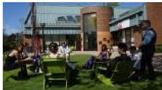
Teens relaxing in front of the Krasl Art Center.

More than twice the number of attendees from our inaugural event were on hand to celebrate!